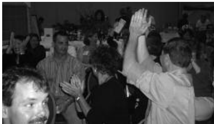
VPTA members applaud a winning bid at the VPTA Annual Conference Auction.